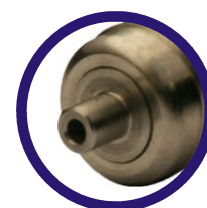
Ferrule 1.25 mm