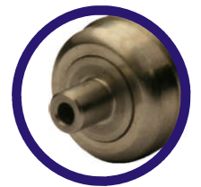
Ferrule 1.25 mm