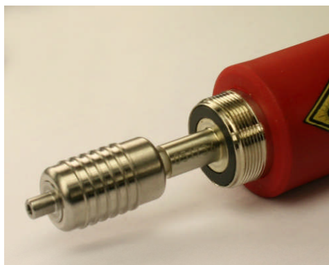
FIBERPOINT® 250 with Adapter