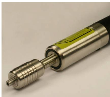
FIBERPOINT® 250MD with Adapter